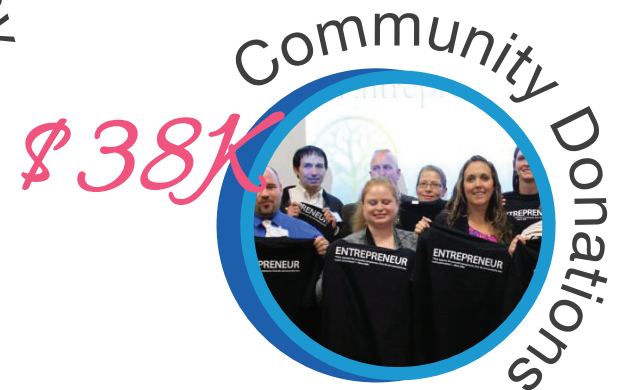
Various donations to Local Organizations, Arts Entrepreneur Development, and Co-Op Marketing