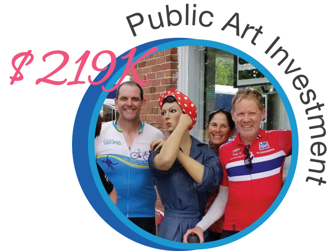
Includes Original Beehive Project, Pocahontas Mural, Seward Johnson Sculptures 2018 & 2019, Daffodil Mural 2018, Watermen Mural 2019 & Purchase of Permanent Seward Johnson Sculpture for Main Street