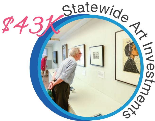
VMFA on the Road – Art Mobile, Donations or sponsorships of regional and state arts organizations.