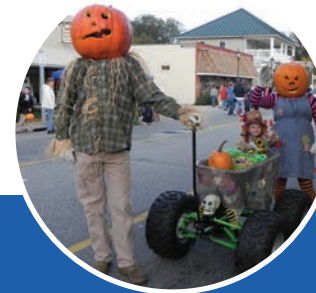
Trick or Treat Kickstarted Annual Trick or Treat on Main Street that continues today through the Gloucester Main Street Association