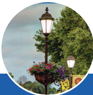
Lampost Baskets Beautification project along Gloucester Main Street