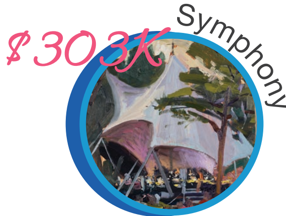
Annual Symphony Under the Stars Outdoor Free Family Concert