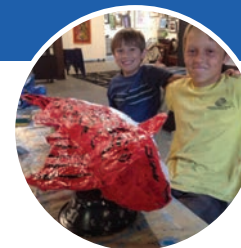
Summer Art Camp Art Camp for children ages 6-12 (2 weeks)