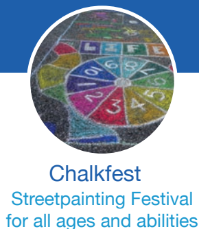
Chalkfest Streetpainting Festival for all ages and abilities