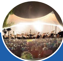
Symphony Under The Stars Annual Free Outdoor Concert