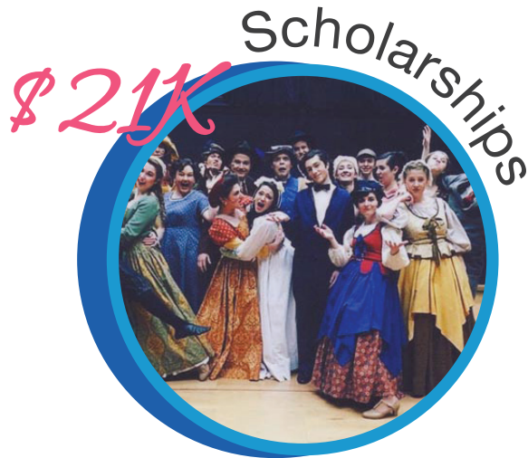
Annual & Renewable Scholarships Awarded