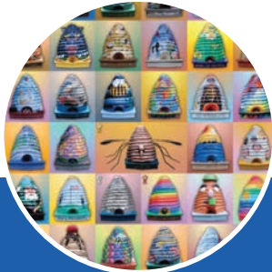
Beehives of Gloucester First Community Public Art Project