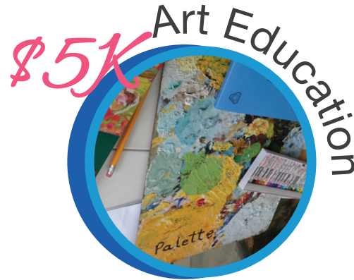
Donations to Gloucester County Schools for Arts Programs